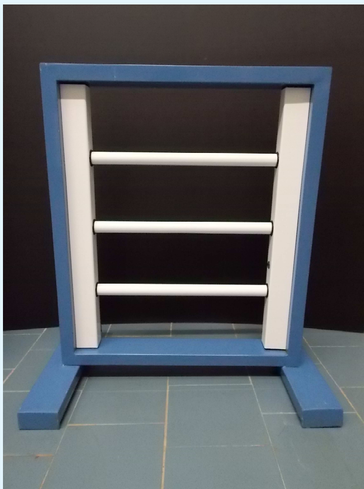
Photo of specimen at end of test

(**) The degree of rusting ranges from " R_i = 0 " (rusted area 0 %) to " R_i = 5 " (rusted area 40 to 50 %).